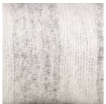
light grey melange / white