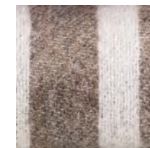
dark coffee melange / white