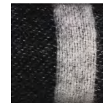
black melange / light grey