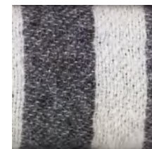
charcoal melange / white