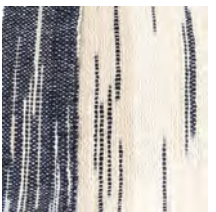
blue / cream / white

Additional colors available. 5 piece order minimum.